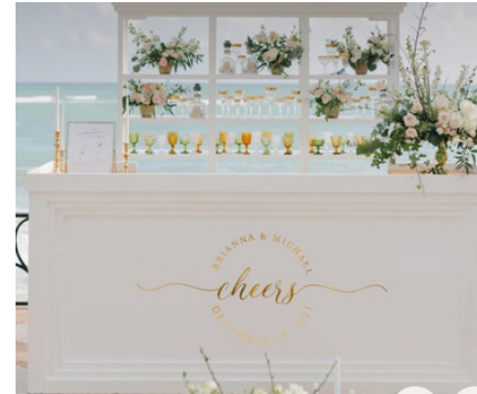
White Bar 8ft $300