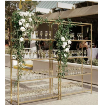
Barback $150 Each