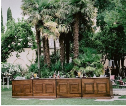
Wood Bar 8ft $350