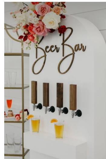
Beer Wall $1300 (Beer not included)