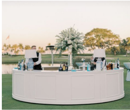
White Arched Bar 8ft $350