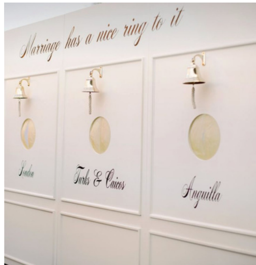
Champagne Wall $1300 (Champagne not included)