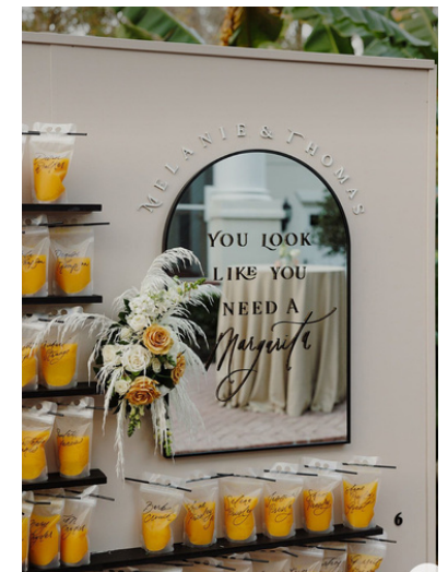
Black and White Wall $1300