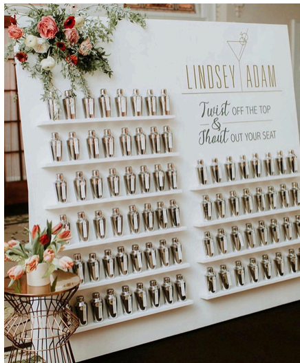
White Wall $950

Bar Glassware $10 per person plus 6% Damage Fee